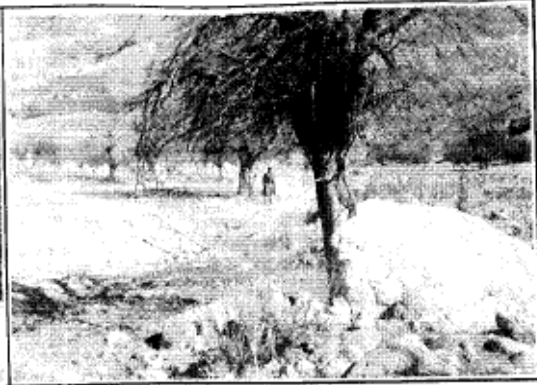
Fig. 3--Water abrasion on walnut tree in wide channel of Trujillo Arroyo, N. M.

Hillsboro has suffered other storms, and people who endured the lethal 1972 flood still live here. I'm hoping someone who was there will write the story of that flood.