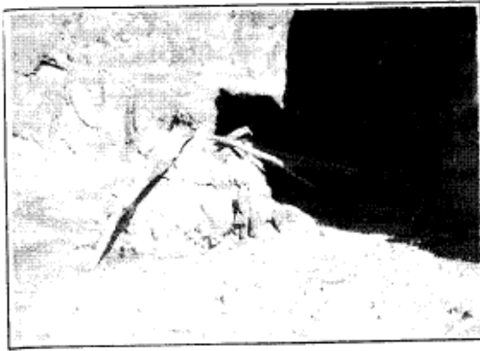
Fig. 2--Log jam caused by flood of June 1914 in Sibley Mt. box of Trujillo Arroyo, N. M.